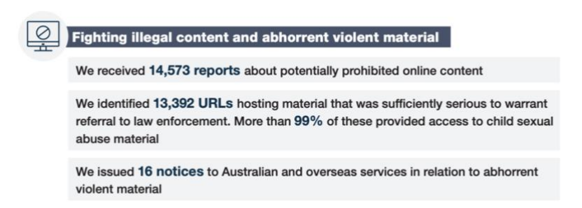
Figure 3: Australia's e-Safety Commissioner "Our year at a glance" on fighting illegal content and abhorrent violent material